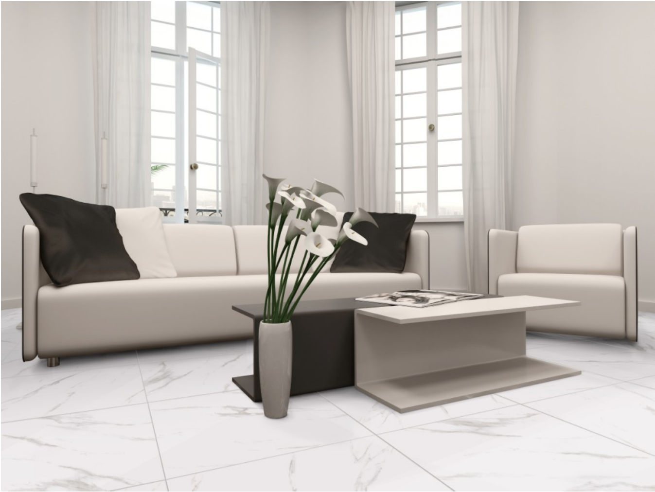
Italian ink-jet design Gres Porcelain Floor Tiles