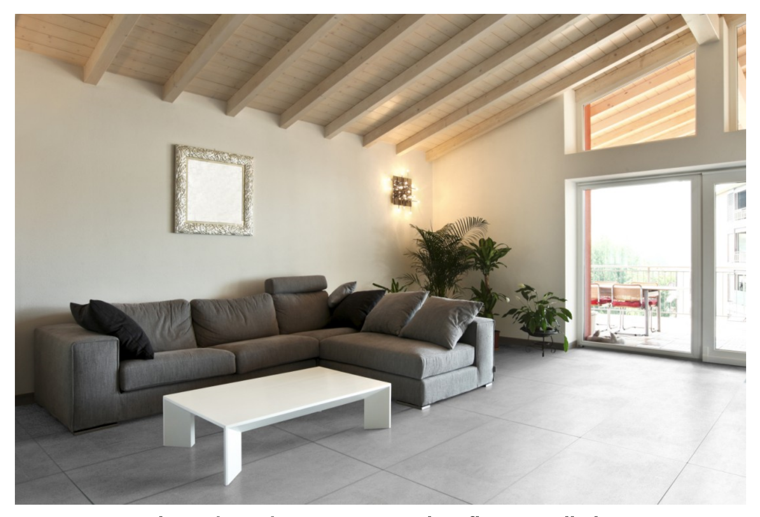
Italian ink-jet design Gres Porcelain floor & wall tiles